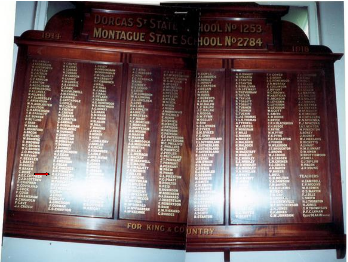
Dorcas Street State School Honour Roll